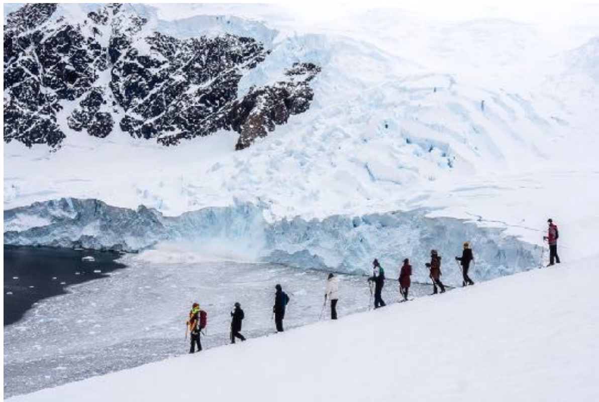
Explore farther during landings

Hiking & Snowshoeing is an optional adventure activity offered in Antarctica. This excursion will be of interest to those active travelers who wish to explore further while on land. A Hiking & Snowshoeing Guide leads a small group of adventurers as they gain elevation and explore the landscape.