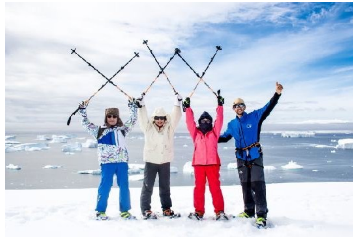
Exclusive small-group experience