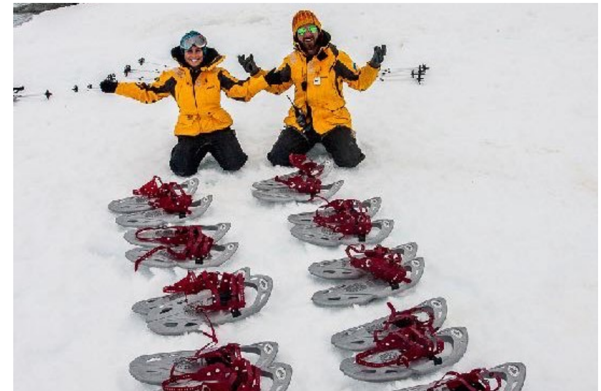
Quality equipment and gear provided