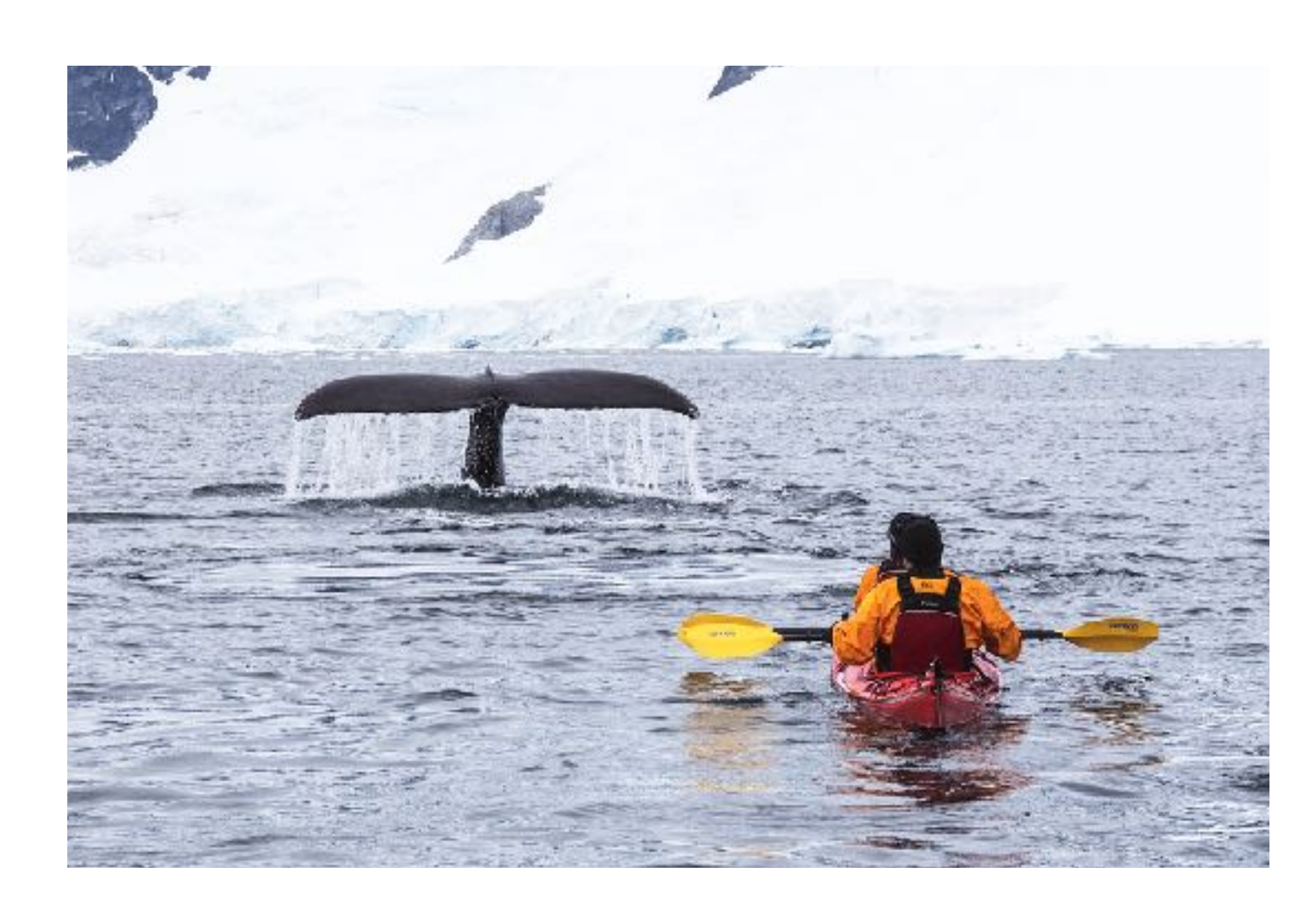
Observe wildlife from a unique vantage point

Kayaking will take your expedition experience to another level. Enjoy a more intimate connection with Antarctica, the Falklands (Malvinas), and South Georgia.