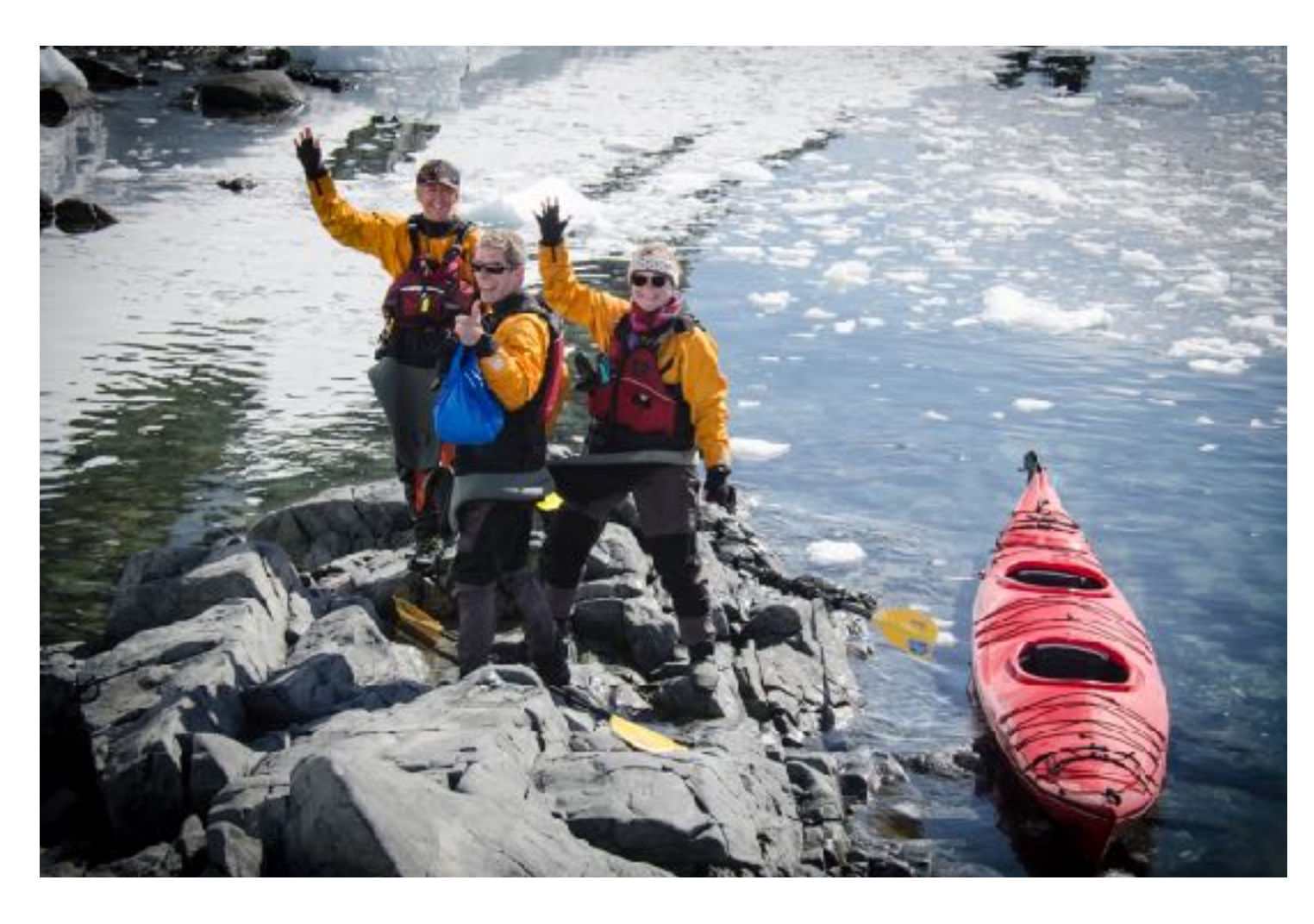
Extend exploration with land excursions