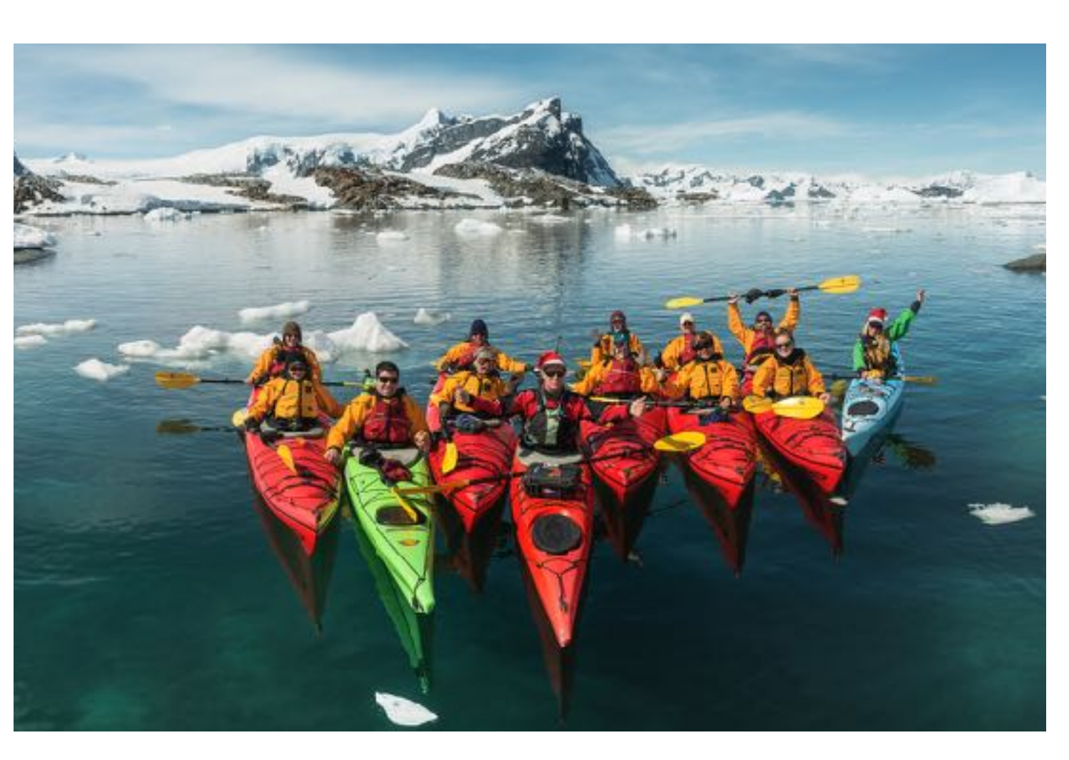
Exclusive small-group experience