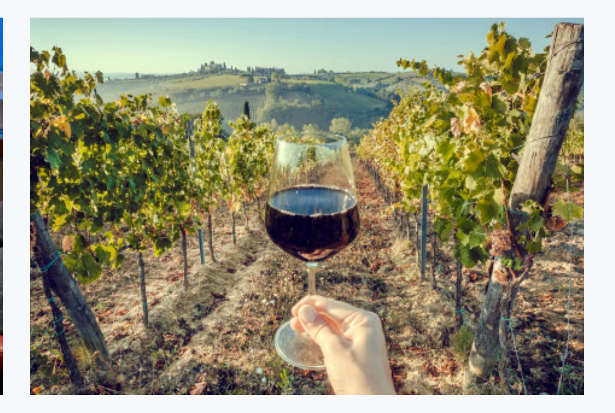
You could extend your trip to:The Wine Valleys of ChileChile's Lake District