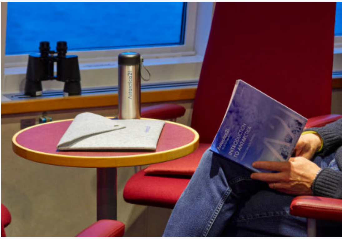
You could: • Upgrade your flight to Business Class • Buy high-quality binoculars