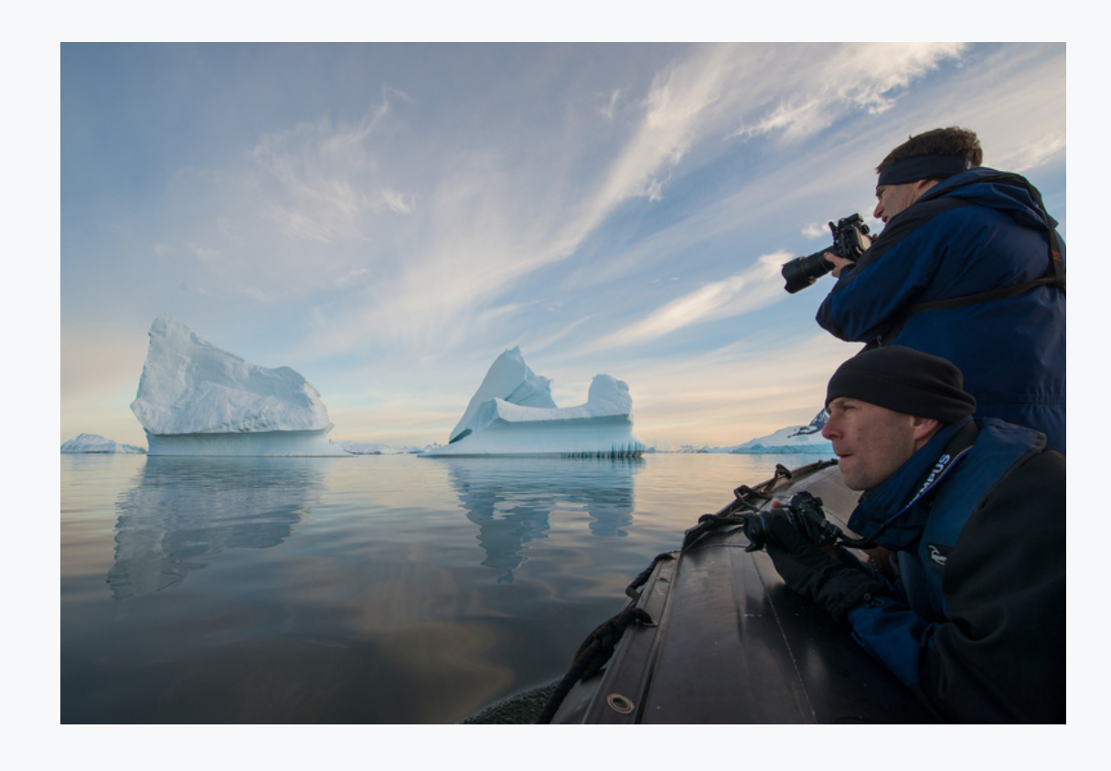
You could buy: • A great outdoor wear and gear • A fancy new camera

What can you do with your Early Booking Promotion? Here are some examples of what you could buy with $2,000 USD.