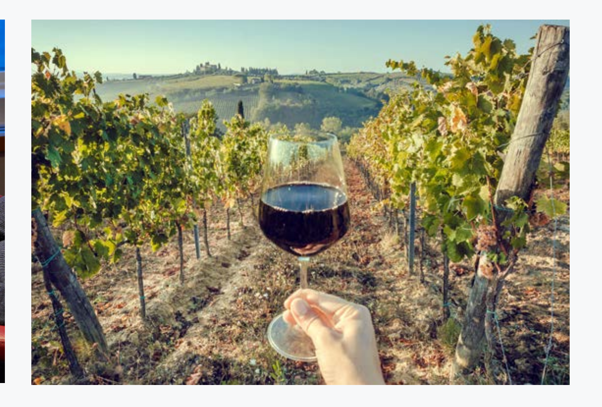
You could extend your trip to:The Wine Valleys of ChileChile's Lake District