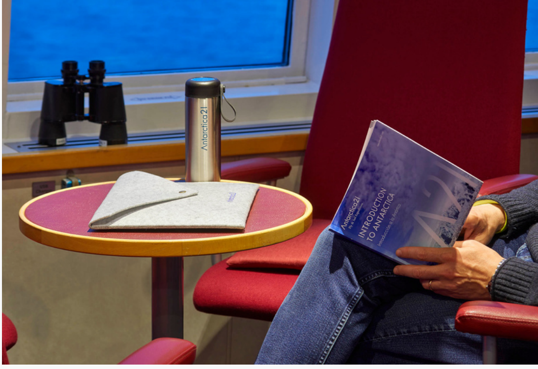
You could: • Upgrade your flight to Business Class • Buy high-quality binoculars