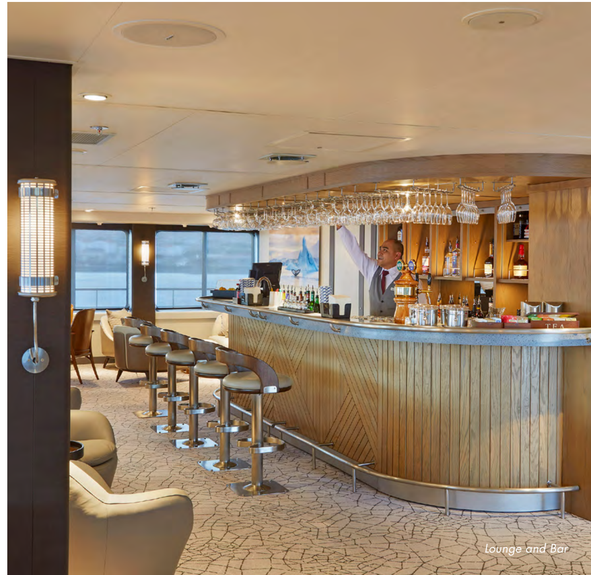
Lounge and Bar