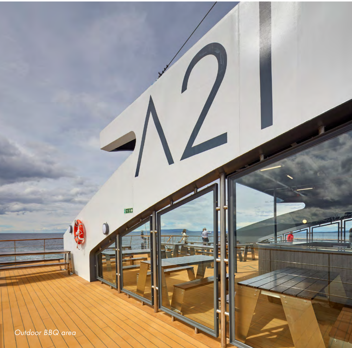
Outdoor BBQ area