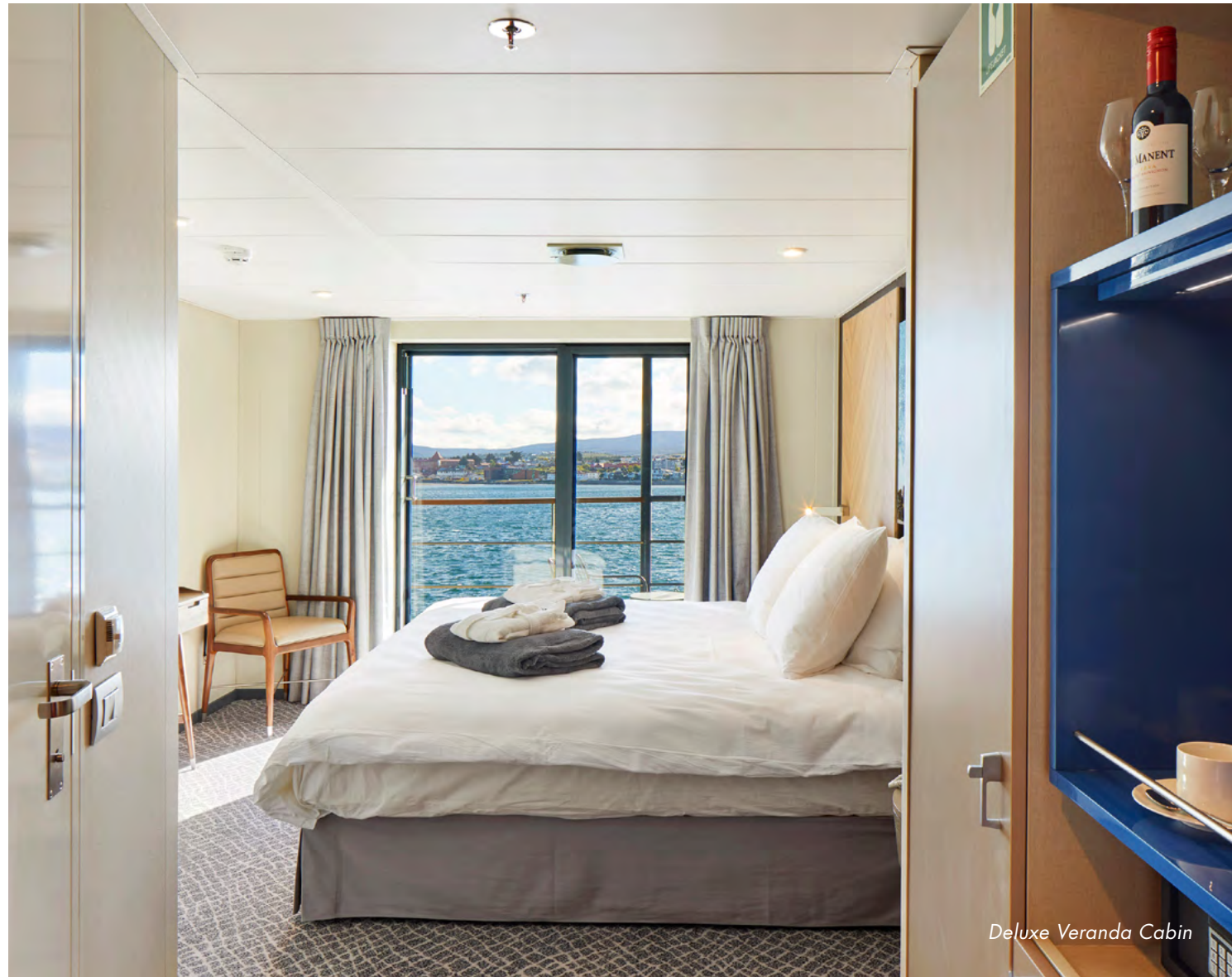
Deluxe Veranda Cabin