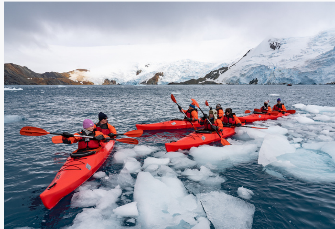
Exclusive small-group experience