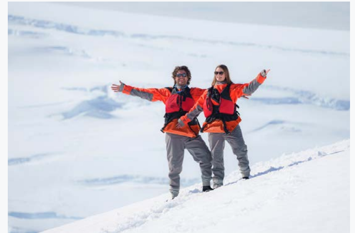
Combine sea exploration with land excursions