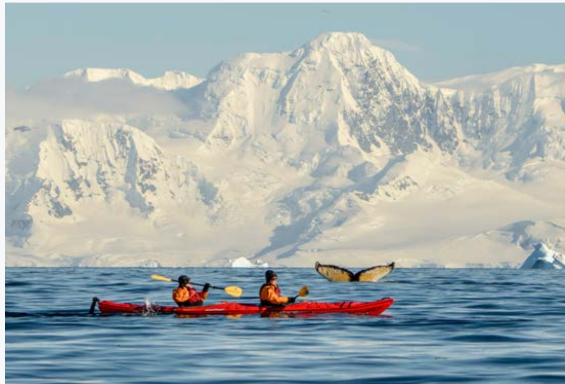
Observe wildlife from a unique vantage point

Kayaking will take your expedition experience to another level. Enjoy a more intimate connection with Antarctica and Southern Patagonia.